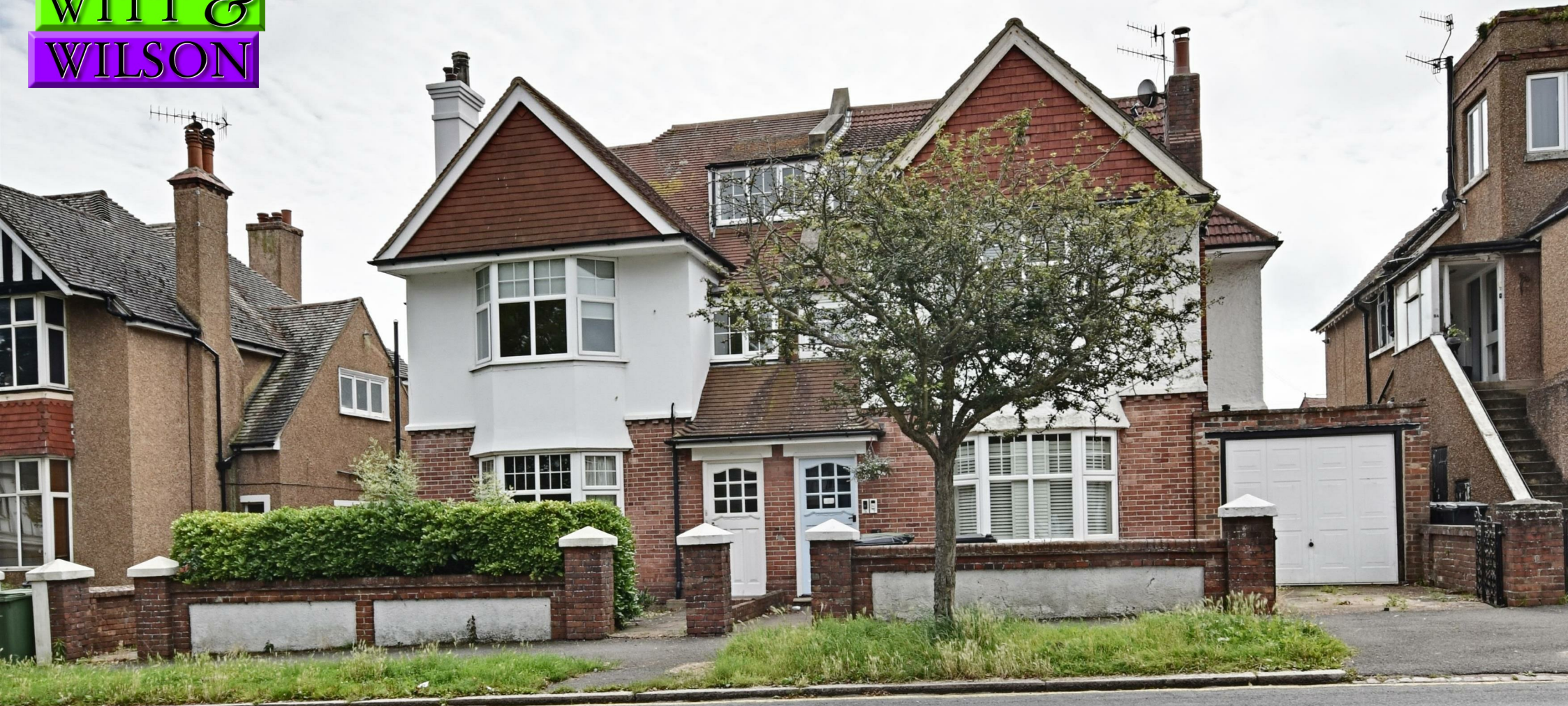
5a Collington Avenue, Bexhill-On-Sea, East Sussex TN39 3PX £259,000